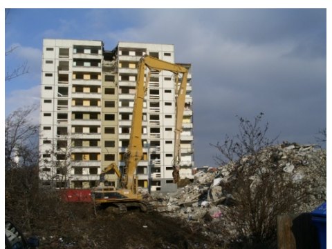
Figure 6: View of parts of the case study site in Halle/Salle

So far there is no concept for an intended future use but as intermediate use biomass production through planting of poplar trees as short rotation crops for energy purposes started in 2006 and 2008.