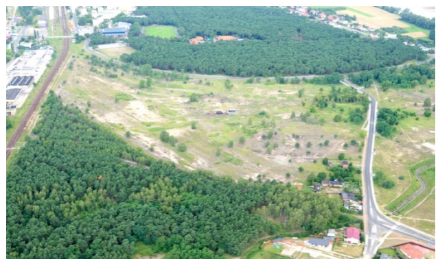
Figure 8: View of the case study site in Solec Kujawski

A major brownfield within Solec Kujawski that was selected as a HOMBRE case study site, is the location of a former wood preservation factory. The area is now abandoned and the aboveground infrastructure largely demolished, but soil and groundwater are still heavily polluted with creosote (containing the allied products of dry coal distillation like PAHs, BTEX, Phenols), mineral oil and PCBs, that were used as additions.