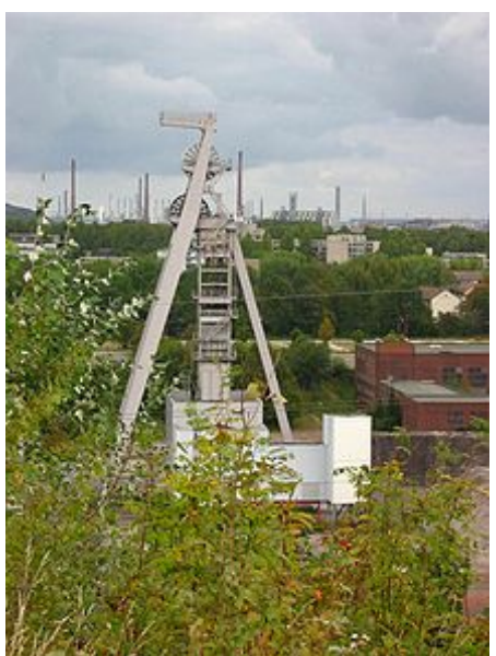
Figure 2: View of parts of the area in Gelsenkirchen

The project was faced with several problems. After the demolition of the present mining and coal power plant structures, the site's situation was still not sufficient for an immediate reuse in that other remedial measures were required. Moreover, annual costs for traffic safety and regulatory obligations occurred. The earthworks started on land assessed of its suitability for biomass production in 2011.