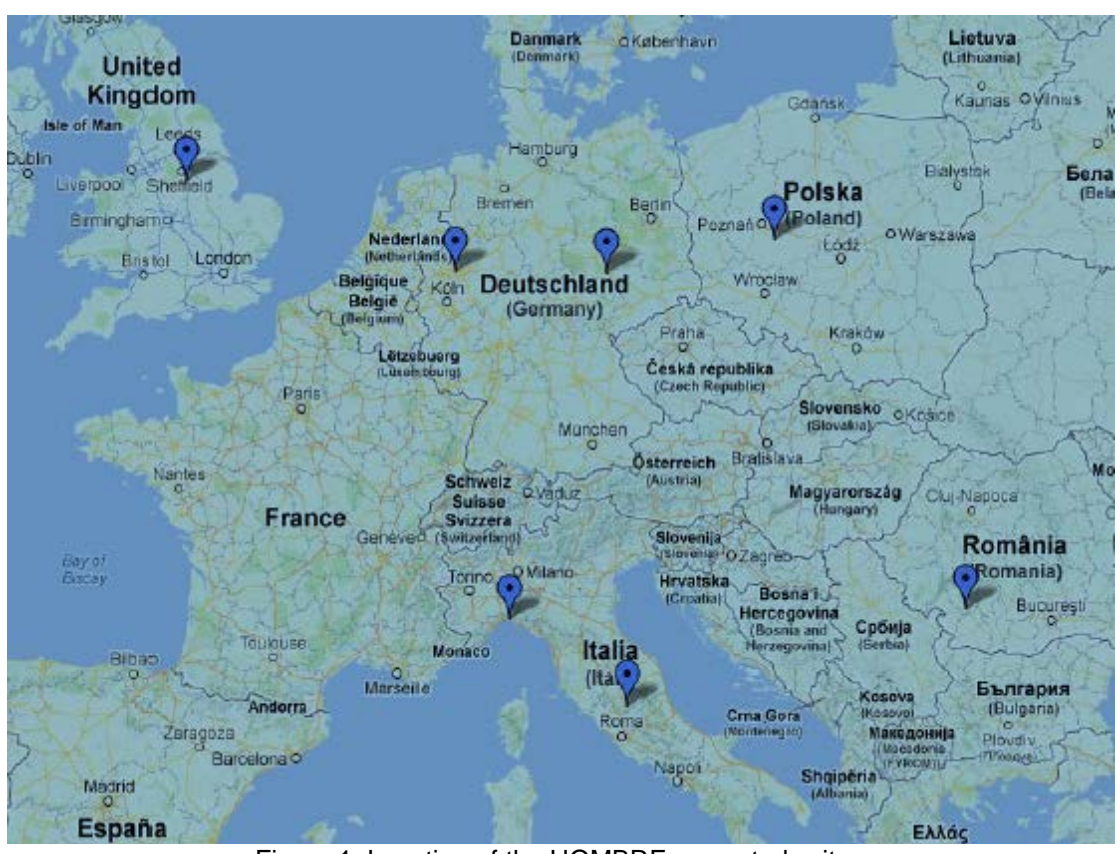
Figure 1: Location of the HOMBRE case study sites