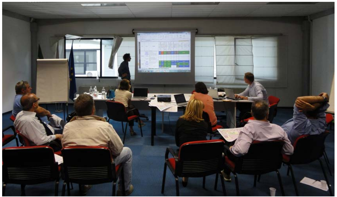
Figure 5: Introduction to the Brownfield Opportunity Matrix during the stakeholder workshop

In a workshop that was held in May 2014 the Brownfield Navigator and the Brownfield Opportunity Matrix and stakeholder engagement process were tested and discussed with the stakeholders.