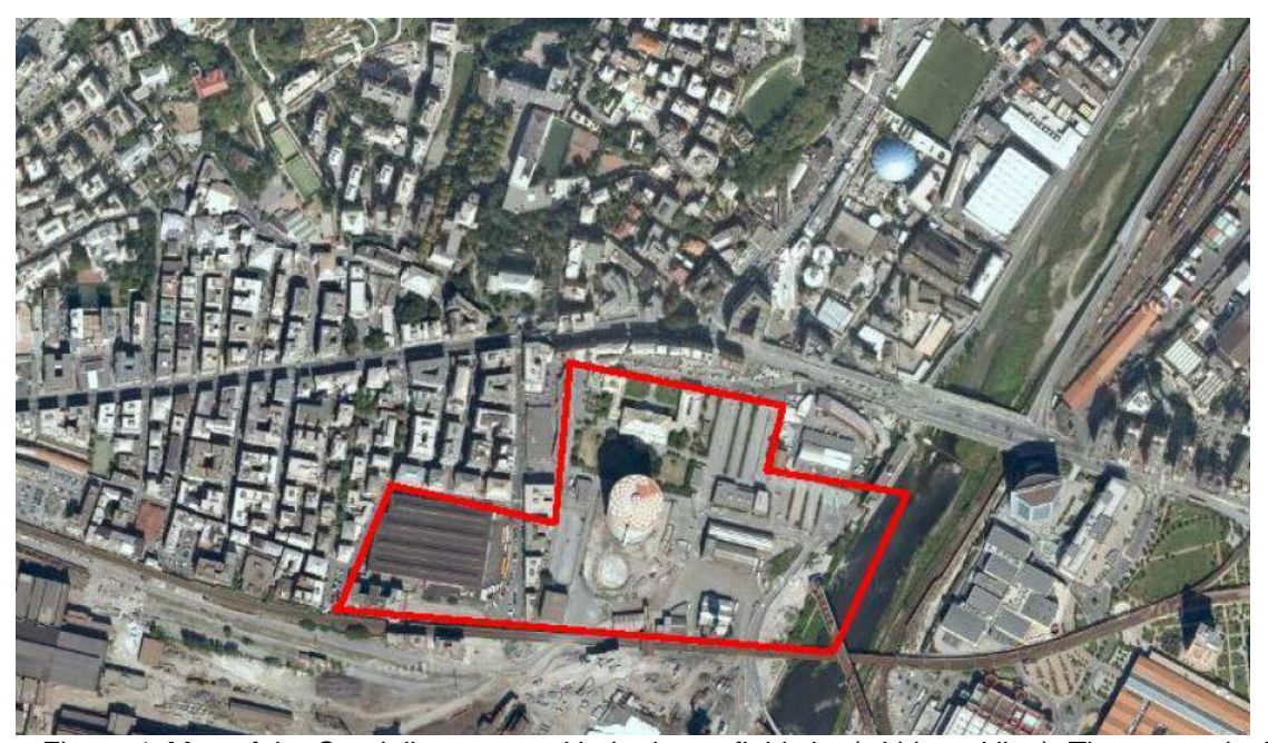
Figure 4: Map of the Cornigliano area with the brownfield site (within red line). The gas tanks in the centre of the site have already been demolished. Just north of the gas tanks villa 'Bombrini' is shown.

The Polcevera project aims at complete regeneration of the area and a connection between the stream and garden/recreational area that is planned on the western bank by the PUC (Municipality Urban Plan, approved in 2014). The overall project includes also the redevelopment of the brownfield, a former steel industry. This case is a C-site, selected because of its focus on a Mediterranean area and a good selection of stakeholders with their own views, so it can offer different challenges for requalification. At the moment, reclamation has been done for new productive destination and the Administrators at different levels (Region, Municipality) are still assessing the final end use, even if 50% is already designated to green and open spaces.