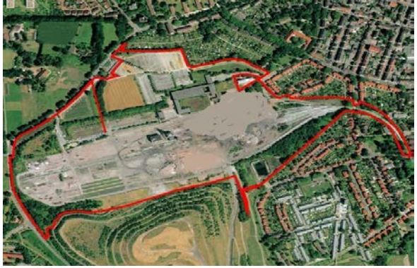
Figure 3: Biomassepark "Hugo"

The owner of the site is RAG Montan Immobilien GmbH. For the realization of the new landuse concept they work together with the municipality of Gelsenkirchen, the Ministry for the Environment and the EnergieAgenturNRW which is a regional agency dedicated to forestry and wood production in North Rhine-Westphalia.