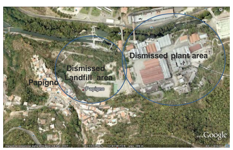
Figure 9: View of the area in Papigno/Terni

The site is split into two different parts; one part is a dismissed landfill and the other part is a dismissed plant area. The industrial site is almost completely abandoned. As a result of industrial use in history, parts of the soil and groundwater are contaminated.